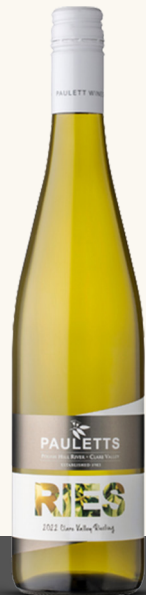
G $10 | B $45 Pauletts Riesling 2022 Clare Valley