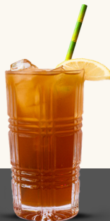
$5 Housemade Lemon Iced Tea