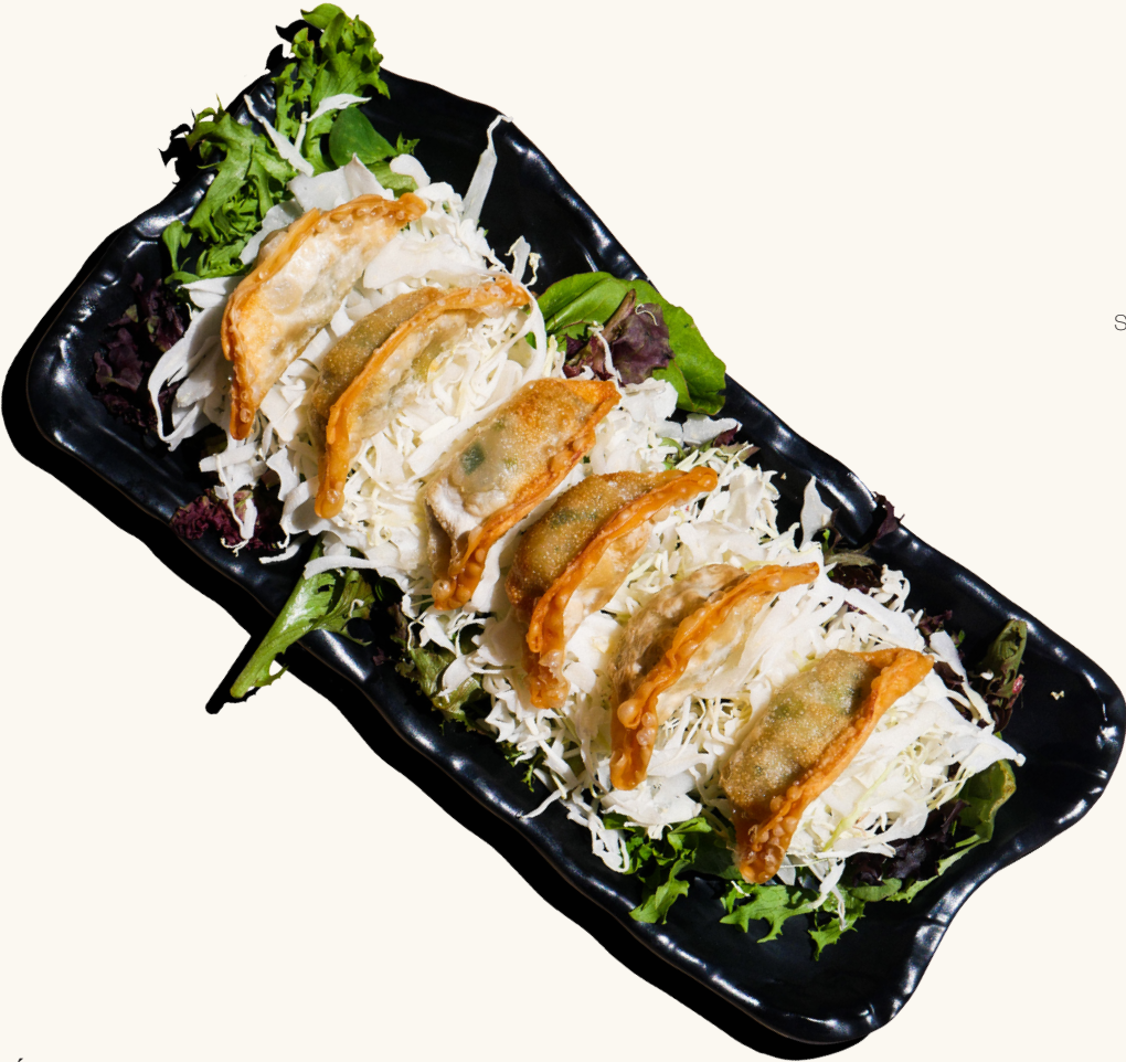
$15 Mandoo Lightly fried vegetable dumplings with our tangy sesame soy sauce.