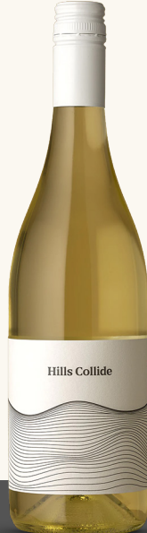
G $12 | B $52 Bright White Veltliner Hills Collide Gruner Riesling