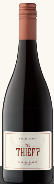
G $13 | B $58 The Thief? Shiraz Red 2022