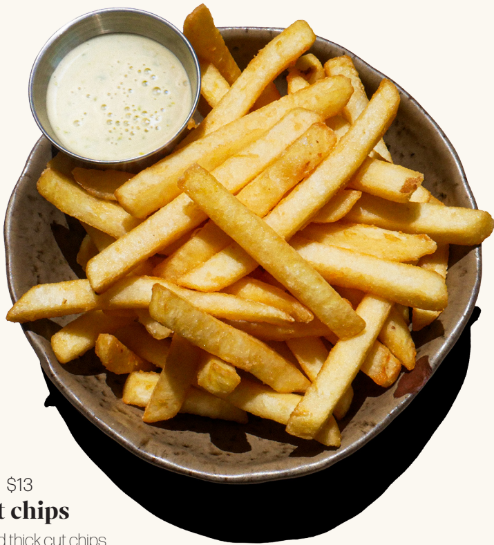
$13 Fat chips Seasoned thick cut chips served with green chili mayo