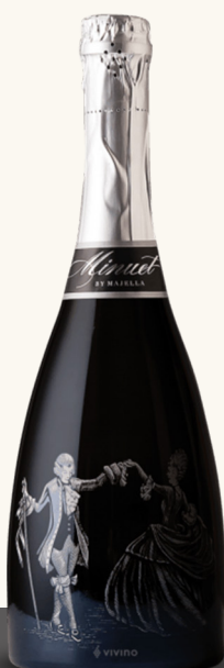
B $65 'Minuet' Sparkling Red, berry Rich