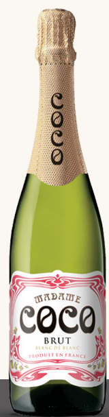
B $55 Madame Coco Brut Blanc de Blanc Aude Valley