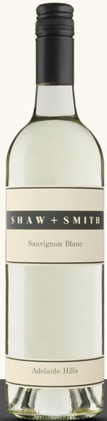
G $16 | B $56 Shaw & Smith Sauvignon Blanc White 2022