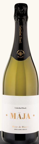
G $13.5 | B $65 Maja Sparkling Chardonnay Pinot noir