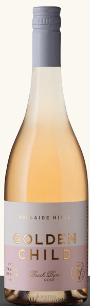
G $16 | B $56 Golden Child "Beach Bum" Rosè 2022