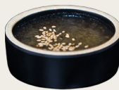
Soy & Garlic