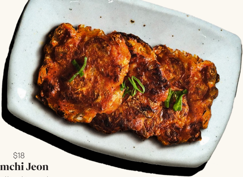
$18 Kimchi Jeon Pan-fried kimchi pancakes.