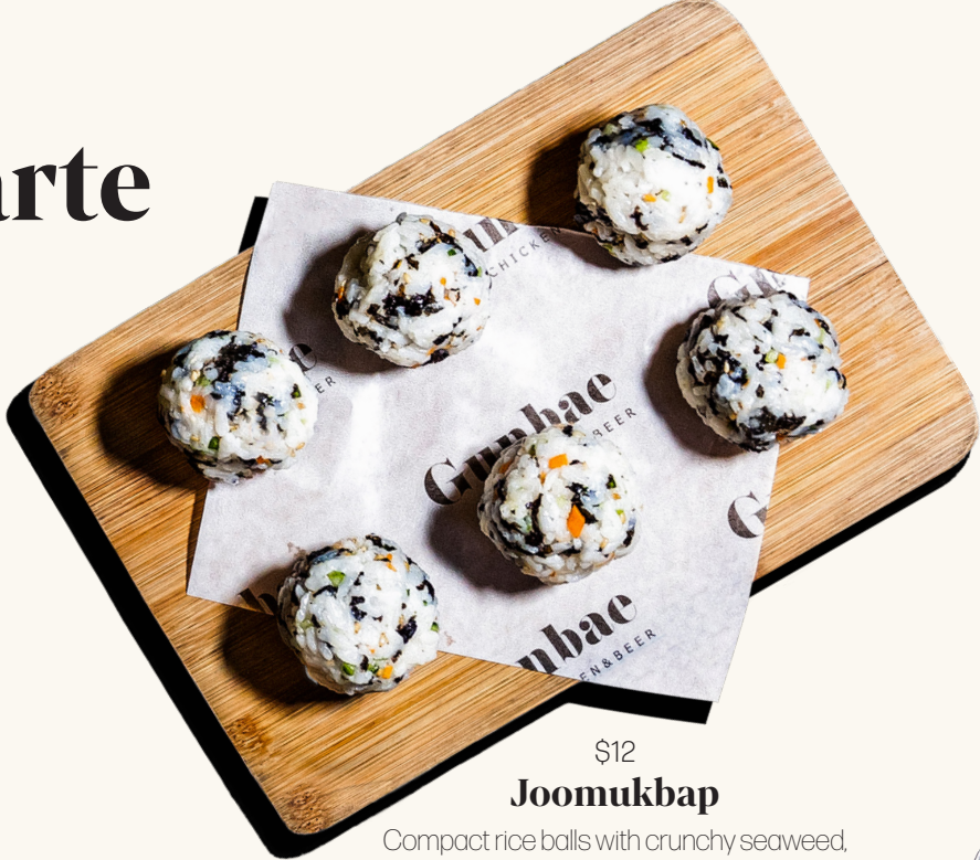
$12 Joomukbap Compact rice balls with crunchy seaweed, cucumber, carrot and seasoned rice.